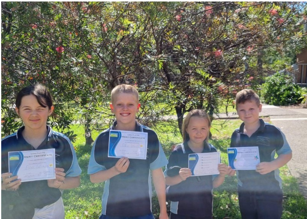
Students with Merit Certificates