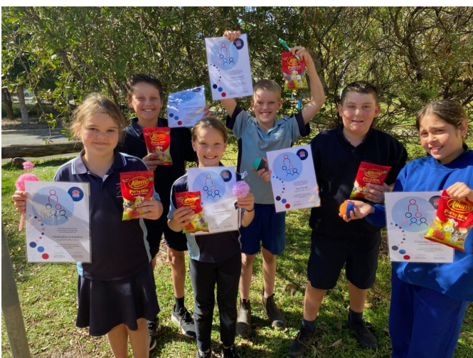
Public Speaking Entrants 2022