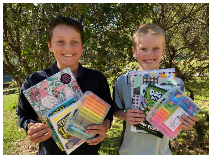
Public Speaking Winners 2022