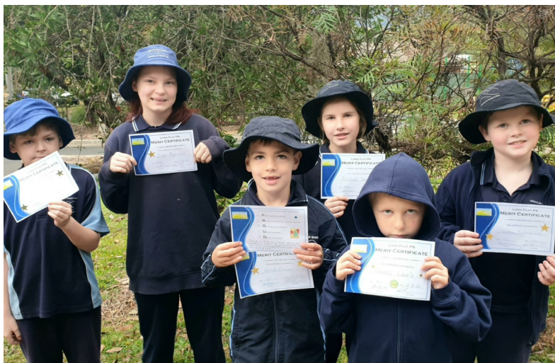
Merit Award Recipients Term 3 Week 4